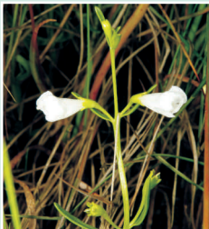
Rare white flowers