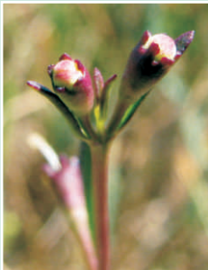
Flowers in bud